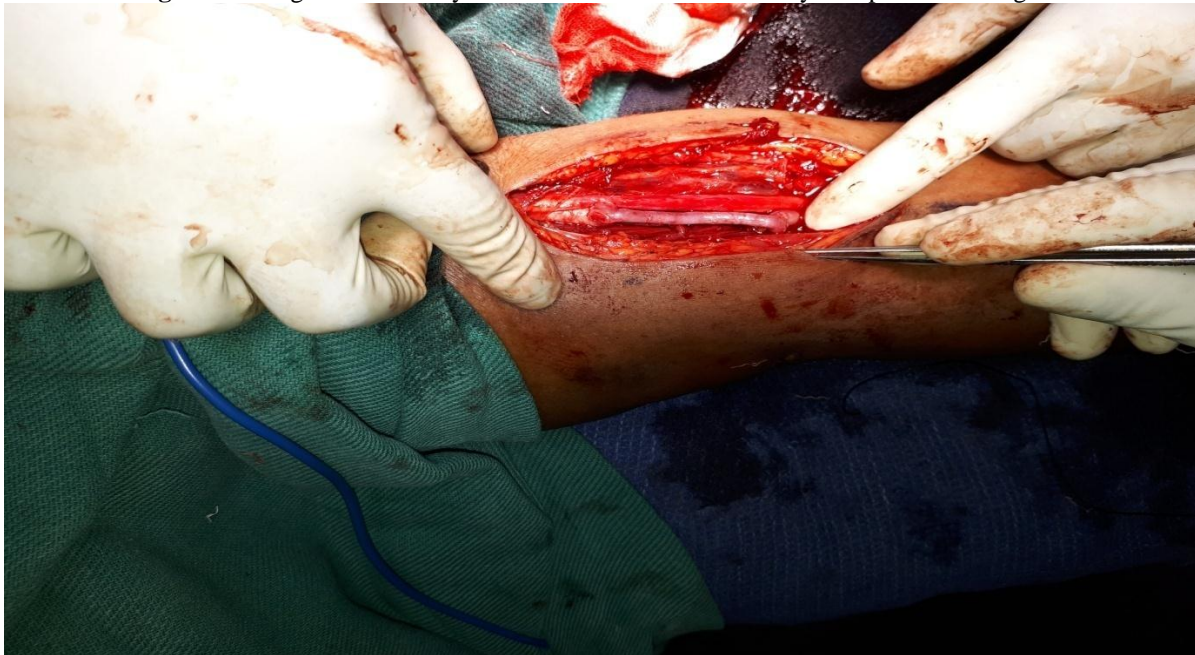
Fig 3:- Showing brachial artery contusion thrombosis treated by interposition vein graft

After restoration of forearm pulses, the elbow was immobilised with a plaster cast from the hand to just below the shoulder for 4 weeks. In all cases, continuous evaluation of the neurovascular status of the hand was required after the surgery. Four weeks postoperatively, the cast and the K-wires were removed and the rehabilitation programme was started.