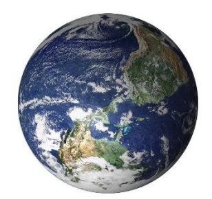
Figure 1: The spherical cosmos and the footstool of God: Acts 7:49; Isaiah 40:22; 66:1; cf Job 26:10

The Bible opens with theopneumagensial statement of declaration unequivocally in Genesis "In the beginning, God created the heaven and the earth" (Genesis 1:1); God explicitly states the number of days He spent to complete the cosmic design (Exodus 2:11); and the method He employed to create the cosmos clearly stated in the Bible (Gen 1:3, 6, 9, 11, 14, 20, 24, 26, Ps 33:6; 148:5 Hebrews 11: 3). In the beginning, God created the heaven and the earth. The subsequent verses detail how God transformed the formless earth into a habitable planet and filled it with life through the involvement of His Spirit – the Holy Spirit (Gen 1:1-31)<sup>6</sup>. The Bible further asserts that God laid the foundation of the earth from the beginning and heavens are His handiwork (Heb 1:10). What is more, the Bible, unequivocally, avers that through faith the universe was created by the Word of God. In other word, the invisible created the visible (Heb 11:3). God spoke and