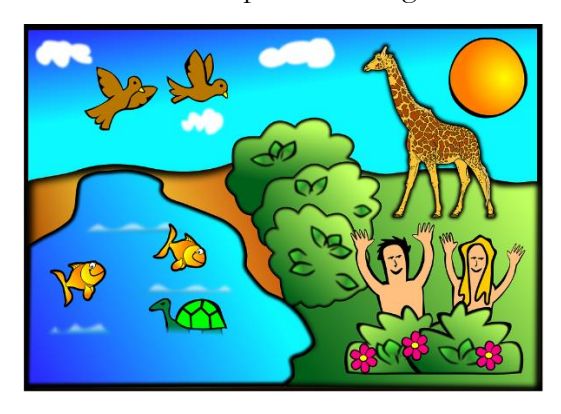
Figure 3: God, as a Spirit, created the universe, including man, and gives understanding with continuous transformation.