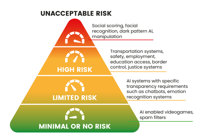
Figure 1 - Risk Assessment Hierarchy

The AI Act establishes a risk-based classification, dividing the use of AI into the categories of "unacceptable, high, and limited or minimal risks," as per the graphic in Figure 1.