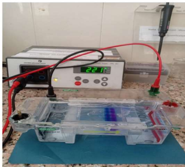
Figure 1.1: samples are in gel electrophoresis

20 samples were collected from ten males and ten females, Results of our study showed that 16(80%) generates complete profile whereas 2 (10%) yielded partial profile and 2(10%) showed no results.