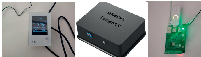
Figure 2. IoT Infrastructure (Temperature, humidity, and CO2 IoT sensor; SIEMENS TargetV device; Raspberry Pi 4 Model B IoT Gateways)

and interoperability between IoT, cloud, and edge computing, leveraging 5G and distributed AI technologies for automation and decentralised intelligence. NEPHELE introduces an IoT and edge computing software stack that enables the virtualisation of IoT devices at the edge, supporting openness and interoperability in a device-independent manner. Additionally, it features a synergetic meta-orchestration framework that coordinates cloud and edge computing platforms through high-level scheduling and system supervision. These innovations will be demonstrated and validated across various industries, including disaster management, port logistics, energy management in smart buildings, and remote healthcare. The project will also conduct two open calls and aims to foster a broad open-source community to support its outcomes.