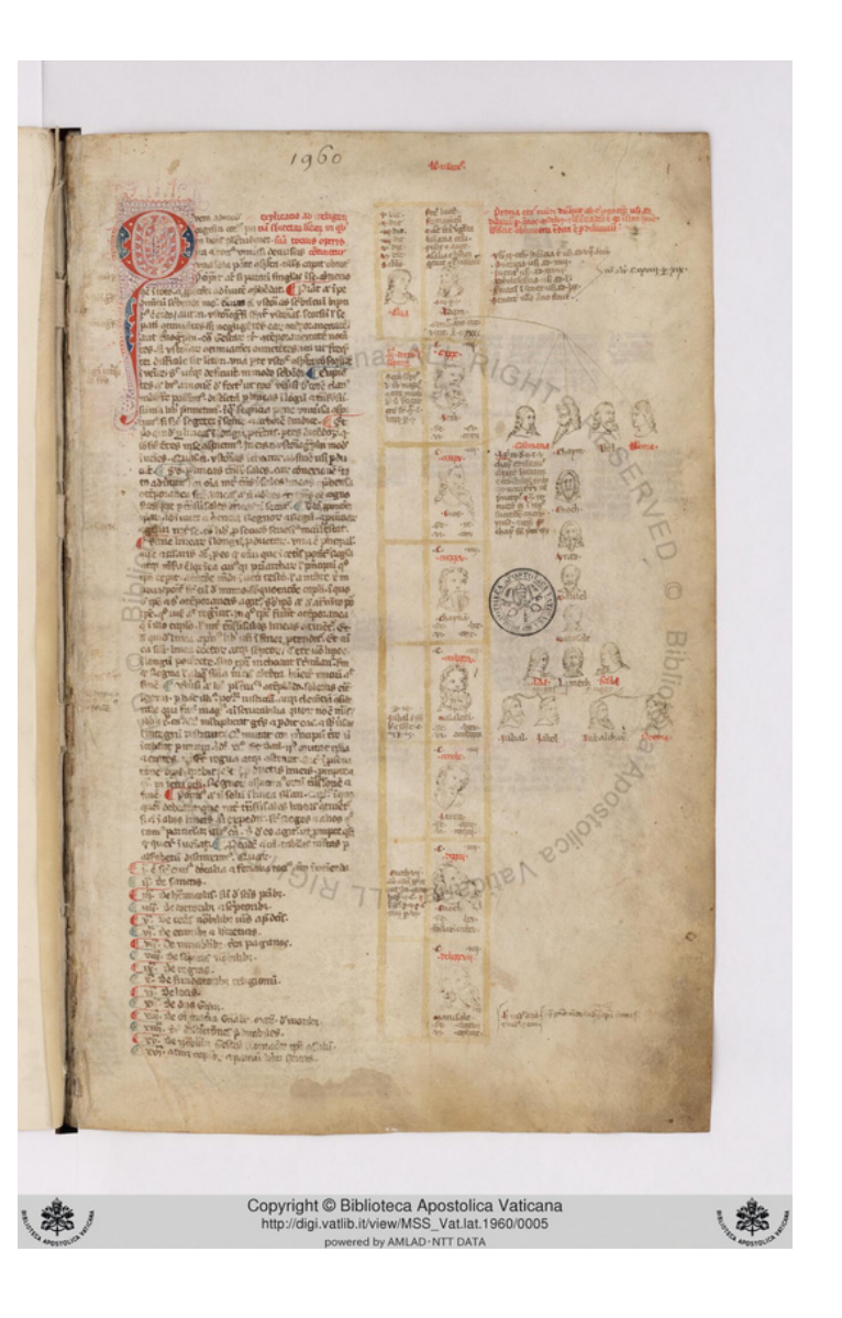
Città del Vaticano, Biblioteca Apostolica Vaticana Vat. lat. 1960, 1r. https://digi.vatlib.it/view/MSS_Vat.lat.1960

A traditional critical edition presents challenges for this type of work, particularly concerning the concise version, which is rich in tables, illustrations, and genealogies. The primary difficulty lies in representing the textual, iconographic, and diagrammatic elements in a different medium while adhering to the chronological framework provided by the author.