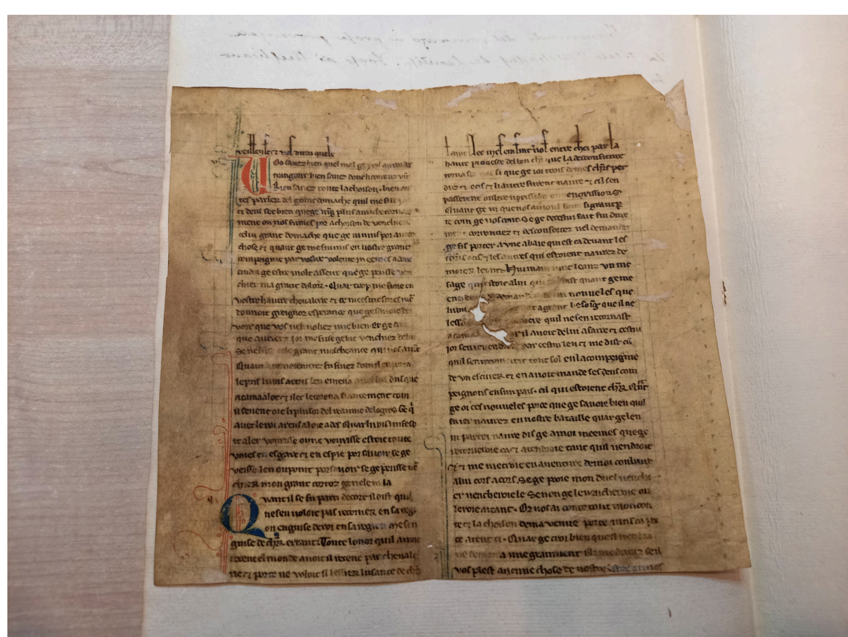
Carpi , Archivio Storico Comunale, Archivio Pio-Savoia, busta 34, fas. 1