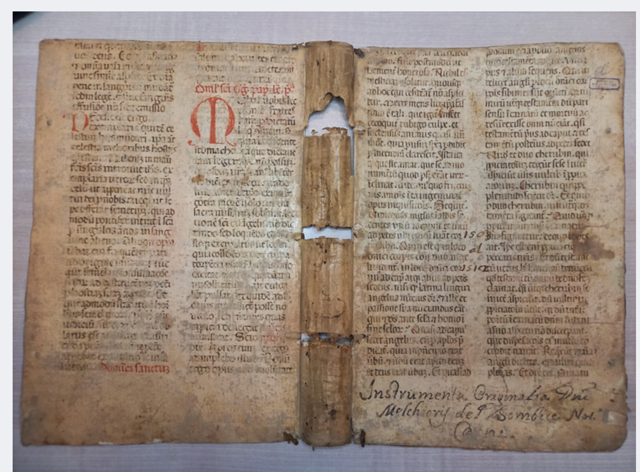
Carpi , Archivio Storico Comunale, Archivio Pio-Savoia, busta 29 , fas. 6