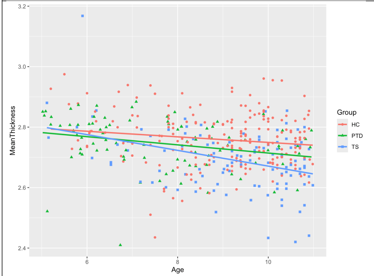
Figure 1. Mean whole-brain cortical thickness decreases with age from 5 to < 11 years old, and does so faster in children with tics.