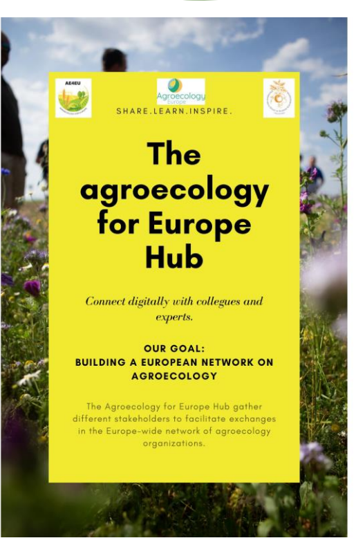
Figure 8. Flyer for the Hub dissemination (both sides).