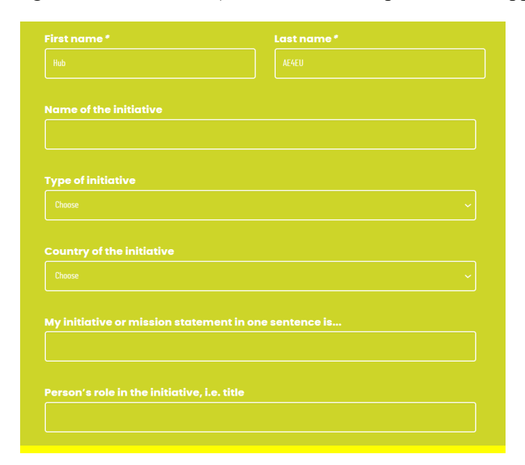
Figure 3. Information required for the personal profile.

From January to August 2023 five meetings were held with the company that provided technically the Hub until October 2023. The objectives of these exchanges were to improve the back end of the hub and solve technical problems of the hub: i.e., automatic messages appeared both in Italian and in English, technical problems with registration (impossible to register for some users) occurred and drop down lists appeared as blank boxes to some users.