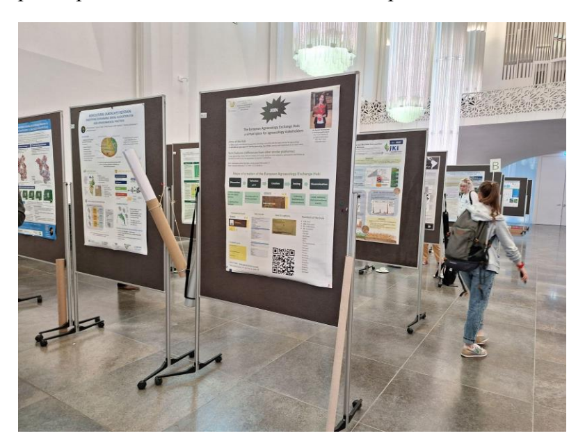
Figure. 7 Poster session of the GfÖ conference.

Poster (Annex 2) with description of the Hub, link and QR code was presented on the poster session (Fig. 7) in the 52nd Meeting of the Ecological Society of Germany, Austria and Switzerland. GfÖ - The future of biodiversity Overcoming barriers of taxa, realms and scales, 12–16 September 2023, Leipzig, Germany. 1200 people with different backgrounds participated in the conference and in the poster session.