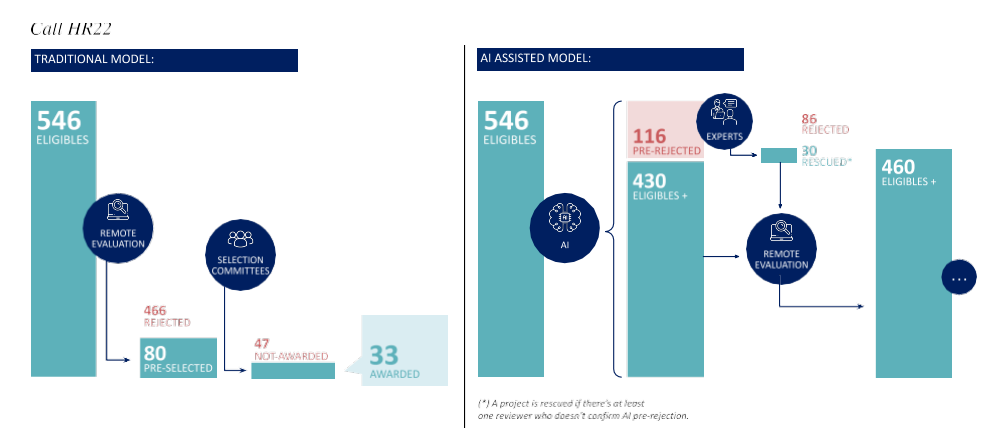
Figure 1. Traditional (left) vs. AI-assisted (right) selection process, with numbers from the parallel evaluation conducted during the HR22 call: 546 proposals were deemed eligible for evaluation and sent to peer review in the traditional track; in the case of the AI-assisted track, 460 proposals would have been sent to peer review, after the algorithm flagged 116 for removal—that is, they were pre-screened by all three models and flagged to be discarded from the process unanimously—30 of which were added back to the evaluation pool by the eligibility reviewers.

few that were not, and were made aware of this. In total, out of 546 proposals, the models unanimously recommended removing 116; 160 were flagged by the majority of the models; and 216 by at least one of them. All 216 proposals were sent to the reviewers, along with 13 that had not been flagged. They rescued 30 proposals, none of which advanced to the panel phase in the actual selection process. However, there were two cases in which 2 independent reviewers confirmed the proposals should be discarded, while in the traditional track these ended up advancing to the panels and ultimately being funded: in the first case, the reviewers failed to spot one of the 13 proposals that were not flagged by the algorithm, while the second case corresponds to a flagged proposal. In both cases, the description of the projects turned out to be largely different from what is normally successful in the call, and in the latter case in particular the remote evaluators delivered mixed reviews due to concerns about the scope of the impact of the project, which was deemed too local.