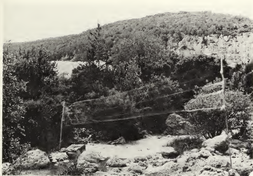
Fig. 2.—Mistnetting site at edge of water pool in Wadi Al Kuf. Habitat of Pipistrellus kuhlii , P. pipistrellus , Nyctalus lasiopterus , Plecotus austriacus , and Tadarida teniotis .

author in 1981. In some instances, the field numbers, indicated by the prefix MQ, are given for specimens not yet catalogued. Specimens will be divided with most deposited in Carnegie Museum of Natural History, Pittsburgh, and some will be deposited in the Kuf National Park Museum, Beida, Libya. One specimen of Pipistrellus pipistrellus from 5 km SW of Al Abra q was examined in the National Museum of Natural History, Washington (USNM). External measurements were taken from the field tags and forearm and cranial measurements were taken with dial calipers. All measurements are given in millimeters. Selected external and cranial measurements of the eight species are given in Tables 1 and 2.