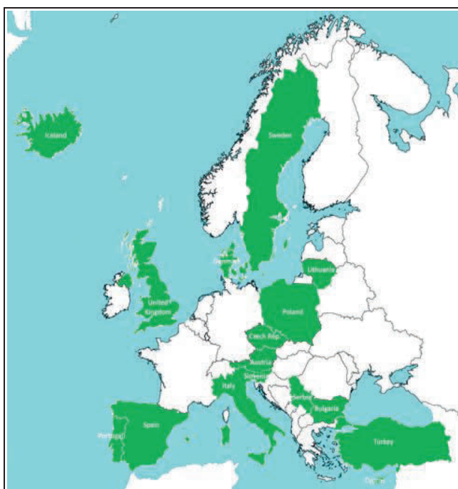
Fig 1 Countries planning to have metadata ready for ingestion in 2014

Austria, Bulgaria, Cyprus, Czech Republic, Denmark, Iceland, Italy, Lithuania, Poland, Portugal, Serbia, Slovakia, Spain, Sweden, Turkey, United Kingdom.