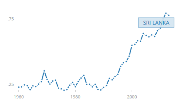
Fig. 1 CO2 emissions from Sri Lanka [6]

The statistics from Fig. 1 with regard to the CO_2 emissions from Sri Lanka depict a rapid increase in the carbon emissions from Sri Lanka. Though 0.794 metric tons per capita might not seem like a massive deal, this release comparison with entire South Asia's CO_2 release (Fig. 2) [7] draws the attention towards the need to create awareness of this energy release in Sri Lanka.