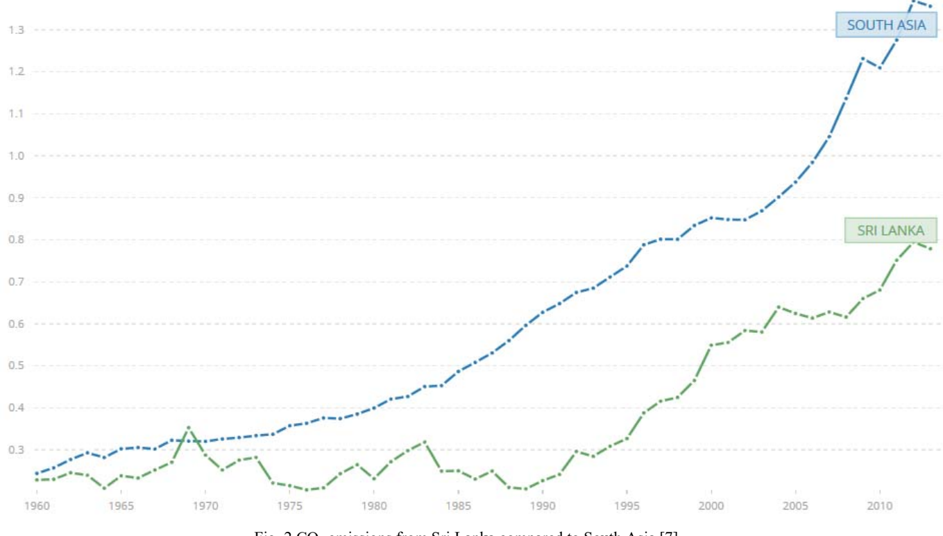
Fig. 2 CO<sub>2</sub> emissions from Sri Lanka compared to South Asia [7]

The statistics from Fig. 1 with regard to the CO_2 emissions from Sri Lanka depict a rapid increase in the carbon emissions from Sri Lanka. Though 0.794 metric tons per capita might not seem like a massive deal, this release comparison with entire South Asia's CO_2 release (Fig. 2) [7] draws the attention towards the need to create awareness of this energy release in Sri Lanka.