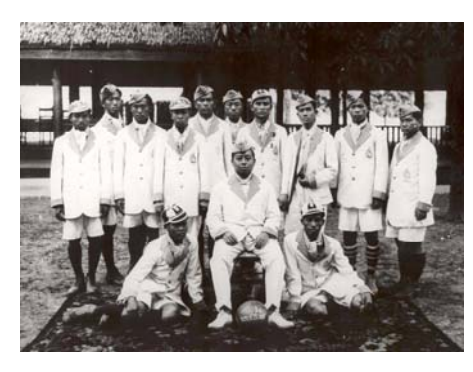
Fig. 4 King Rama VI and the football team [10]

Another activity designed to train men to have gentlemanly behavior was battle exercising and sports competition among members of the Scouts with the purpose of creating unity among members due to His Majesty's initiation about the lack of unity among civil servants [9]. The Scouts was established to serve the king's initiation to solve the problem by requiring the civil servants of all departments to come together to have battle exercises. The successful outcome of this activity was the elimination of the sense of divide among different levels of officials from different working units. Since every member had to respect commander of each level, and His Majesty was commander in chief, this resulted in the acquisition of being loyal and nationalism.