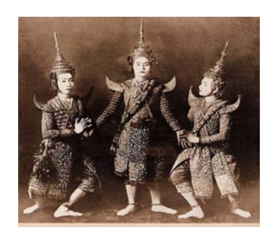
Fig. 1 The traditional Thai performing art [1]