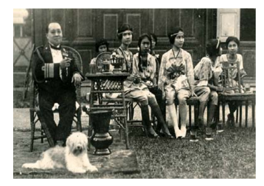
Fig. 5 Women's participation in social activity [11]

The analysis results of King Rama VI's initiation in terms of art and culture disclose the relevance of the theory of modernization especially the state of being up to date in line with western countries. For example, during the flashback of the popularity of traditional handicraft in western countries, in Thailand there was also flashback of the rehabilitation of traditional Thai art and culture to show the national identity and the prosperity of Thai culture, which has been passed on recently. In terms of the definition of culture under the conceptual framework of European Empire Period, since culture was defined as modernization or westernization, Thailand had to show its high standard of culture in accordance with western criterion by creating art and cultural artifacts based on western value and by implanting the practice of gentlemanly behavior among the citizen. Meanwhile, the support of Thai women's status in accordance with that of western countries was also implemented by the change of Thai men's misconception concerning multiple marriage life with more than one wife, the superior of Thai male over female, and the encouragement of women's participation in social clubs and formal school education.