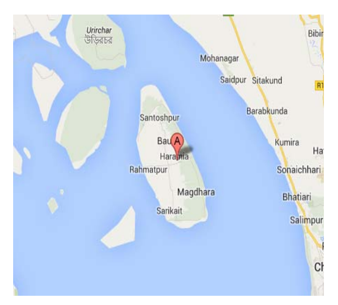
Fig. 2 Sky scenario of Sandwip from Google map [17]

A rough estimate of investment and power production by tidal power in Sandwip are shown below.