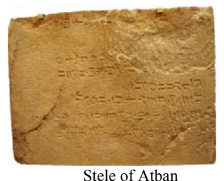
Fig. 1 (a) Steles with vertical writing