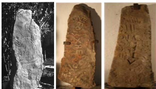
Stele of Kerfala Stele of Sibaou Stele of Agouni Goughrane

According to M.Ghaki [6] the vertical writing would be the oldest, the most current which is lasted more, it is the first orientation which is maintained in spite of the contact with other writings having a different orientation.