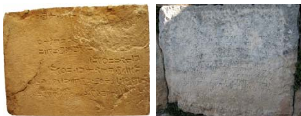
Stele of Atban Stele of Massinissa