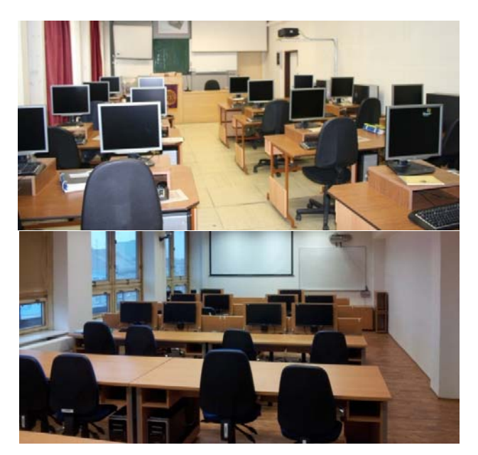
Fig. 2 Other specialized work place for testing Flexible Communication Platform

The task originates from the need to define the activities in the frame of emergency management. It comprises the reconstitution of affected/damaged communication area into a stabilized level, like the ensuring of basic functions in given area, i.e. properties serving for communication, for data exchange, for interoperability etc. The problem will also comprise not only how to stabilize the area but the creation of conditions for further development of communication security area [13]. The test Specialized Classroom (Fig. 1) is connected to other specialized workplaces, among which a testing and exchange of information and data. These are shown in Fig. 2.