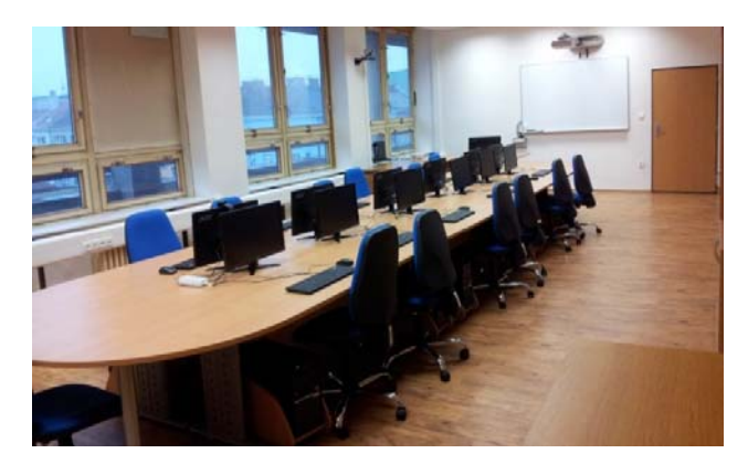
Fig. 1 Specialized Classroom for testing Flexible Communication Platform

There are many research institutes dealing with science and research in communication technologies. They toy with the question of the use of common security technologies and other security options that use the principle of COTS (Commercial Off The Shelf) [1] as much as possible. That means the maximal utilization of commercial products and services to create a specific system or technology [9], [13]. An example is the testing workplace. That is implemented with minor changes in specialized classrooms of Department of Civil protection. This can be seen in Fig. 1.