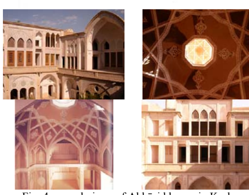
Fig. 4 several views of Abbāsid house in Kashan

Climatic indices and architectural design in traditional housed of Kashan