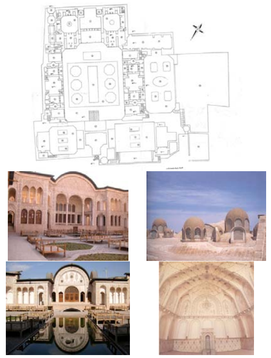
Fig. 2 several views of Tabatabaei house in Kashan

* The house of Ameri in Kashan - Zandiyan - Qajarid Period The Ameri House in Alavi street with area of about 7,000