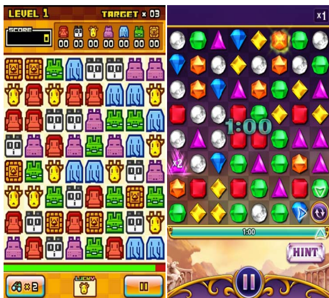
Fig. 2 Zookeeper (Left) & Bejeweled Blitz (Right)