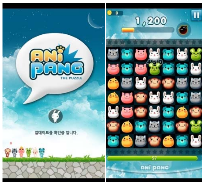
Fig. 1 ANIPANG

equivalent scores of each case. The score depends on the type and number of animals.