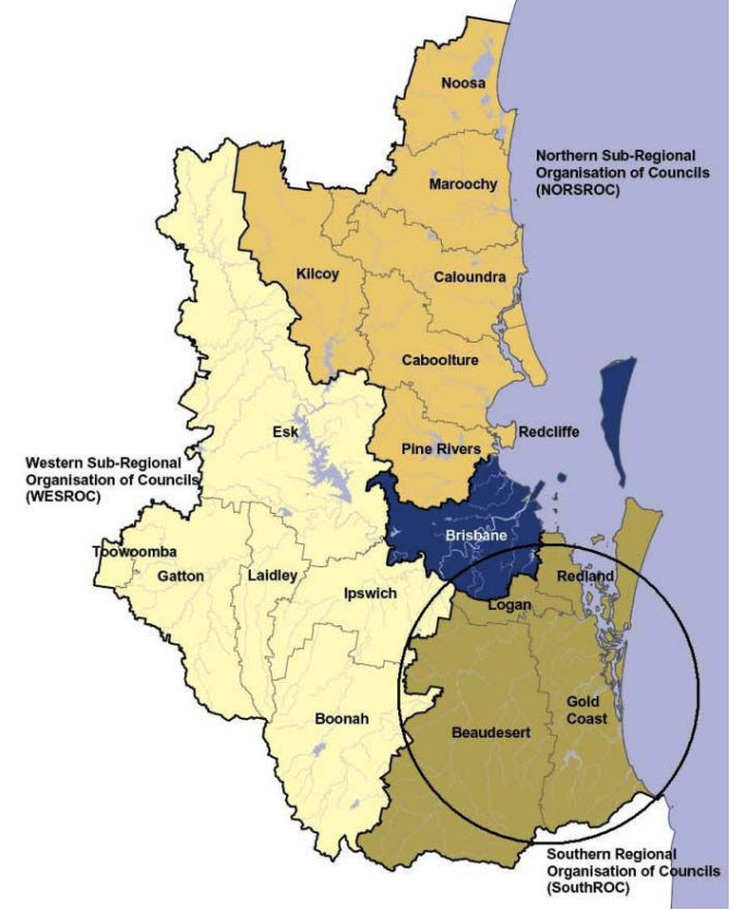
Fig.1. Map of SEQ with the SouthROC area circled.

This study examines the SouthROC which is located in SEQ, Australia; the SouthROC is one of four local government regional collaboration groups that existed in SEQ until the 15 March 2008 council amalgamation process implemented by the State of Queensland Labour Government [15]. The SouthROC has Queensland memberships from Beaudesert Shire Council (BSC), Gold Coast City Council (GCCC), Logan City Council (LCC), and Redland Shire Council (RSC) (Fig. 1) [16]. This study is labelled the ISF of SouthROC; it is one of Australia's fastest growing regions and is experiencing accelerated change from a booming population and strong economy. This scenario discloses an excellent backdrop for the use of an ISF application.