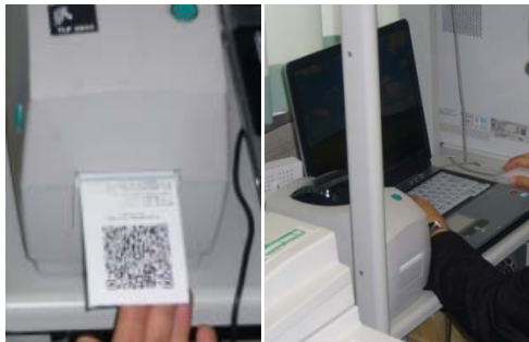
Fig. 3 Change of scene in waste generator

Up to now, submission of a status report for paper issued industrial waste management sheets was required by the government to the generator, and was prepared by transcribing the industrial waste management sheet. However, this report can be automatically prepared by the system developed in this study. Moreover, trends in waste discharge can be identified by exporting the electronic manifest in CSV format, and the information material can be provided for waste countermeasures and environment protection measures.