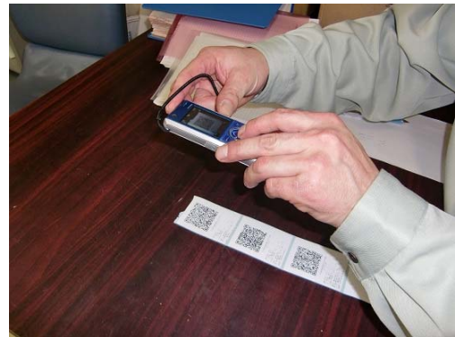
a) The driver reads the QR code by cell phone, and confirms the discharged waste description

Through this verification test, the transporter determined usability of the system developed by this study by the following items.