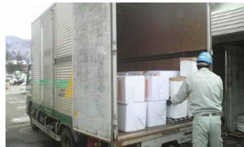
b) After confirmation of discharge description, the driver removes the waste from storage