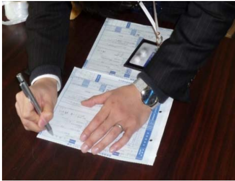
Introduction of the system developed by this study

e) Automatic preparation of the status report for issued industrial waste management sheets