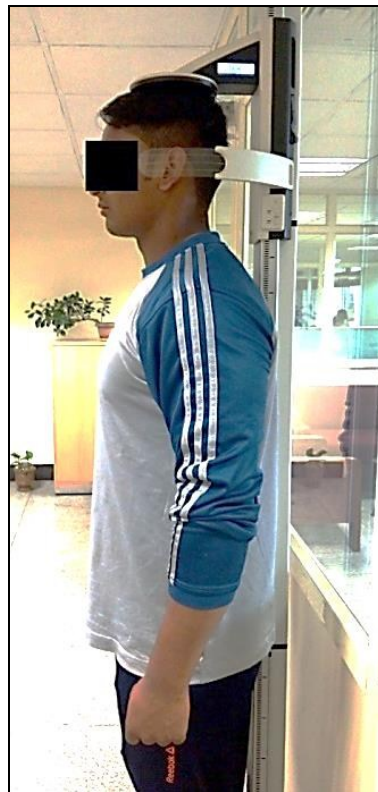
Figure 1: Height Measurement by Stadiometer