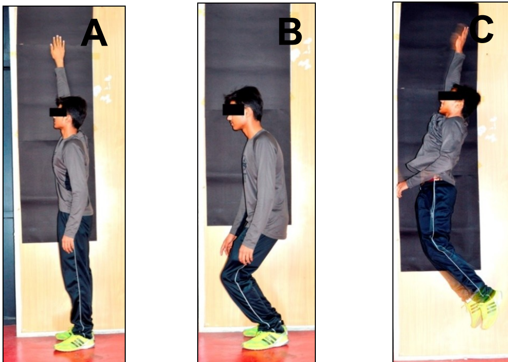
Figure 3: Vertical Jump test. (A) Starting position. (B) Mid Position. (C) End position