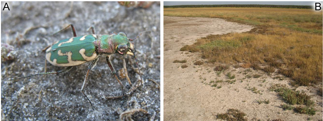
Figure 1. Cephalota besseri (Dejean, 1826) and its habitat: A – total view of imago of the species; B – solonchaks near Bulakhivskyy Lyman Lake (June 2012).

Comments. Endemic of Ukraine. This subspecies was described relatively recently from vicinities of Henichesk town (Southern Ukraine, Kherson Region, environs of the Syvaske (= Sivashskoe) village), but without additional data on distribution and ecology (Danilevskiy, 2001). According to our information, C. deserticola sivashensis is a common subspecies at typical bare saline lands of Sivash gulf (mainland Ukraine), but it has not yet been found in similar habitats of Black Sea and Sea of Azov coasts and in the Crimea. It is sympatric with the ecologically related subspecies Cephalota (Taenidia) elegans stigmatophora (Fischer von Waldheim, 1828). However, these subspecies have different dates of appearance and activity of adults. Imago of C. d. sivashensis appear from the beginning of May, and become numerous (activity peak) from the mid-May til the beginning of June. Few specimens of C. elegans stigmatophora can be recorded from the end of May, while numerous beetles are registered from mid-June to the first half of July. Thus, these two subspecies of the genus Cephalota demonstrate spatial and temporal replacement one by another.