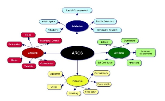
Figure2: Kellers' motivator didactic model (ARCS)

Various models have presented, including Keller learning model (ARCS). Killer believes that, motivation is under effect of individual, environmental, specialties and learning materials. Killer, in his motivational, educational designing, composing theories and motivational procedures with educational designing, and forms an application resultthat causes learners to do more struggle to achieve educational goals EQ emotional model. This model emotion or feeling has much effect on learning Sam 2009. After making emotional remembrance as compare with text reports, that essential motive comes manifest the emotional model of human is, as a positive spectrum of emotions like joy, pleasure, hope and sympathy and negative spectrum consist of sadness, anger, fear disappointment and aggressiveness, emotion in the procedure of education must be in positive spectrum and preferably must be in the form of active and several of learning model which must take care to archive goals.