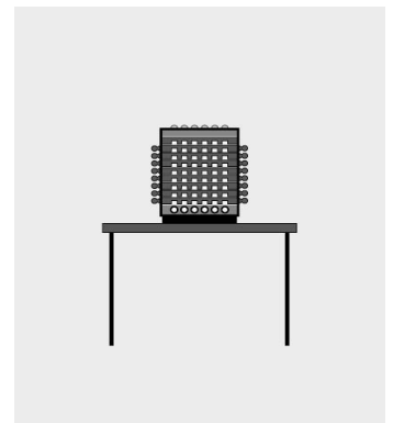
tabulator symbol designed by mainzed

05. Where is mainzed located? As a network, mainzed is spread across the locations of all six partner institutions. The office is located at the Mainz University of Applied Sciences. Here, the administration of mainzed is operated and information on mainzed is distributed.