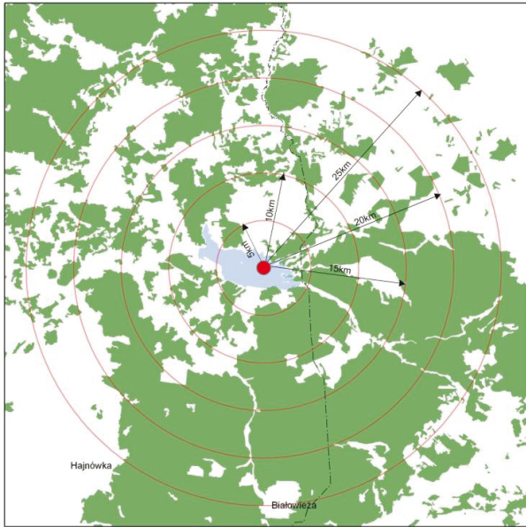
Figure 1. Study area. Observation point (red dot) near Siemianówka Reservoir (blue). Buffer zones (5, 10, 15, 20, 25 km) for cover area from which bats may fly to Siemianówka Lake.

observations to evaluate possible reasons for the large aggregation of bats (data from the meteorological station IBS PAN, Białowieża).