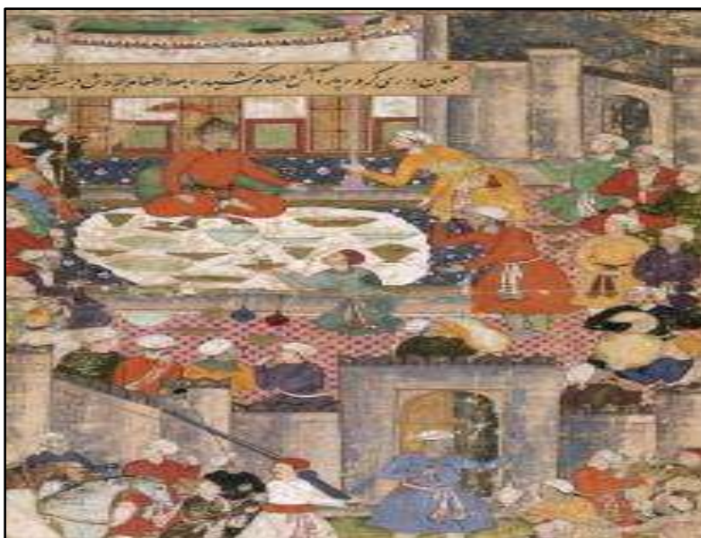
Fig. 2 – An illustration from the Babur nāma