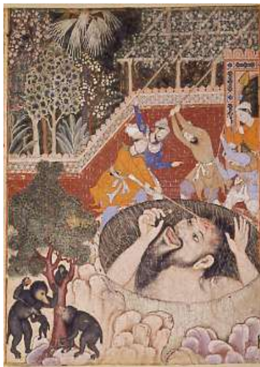
Fig. 8 – Zummurud Shah beaten up by guards