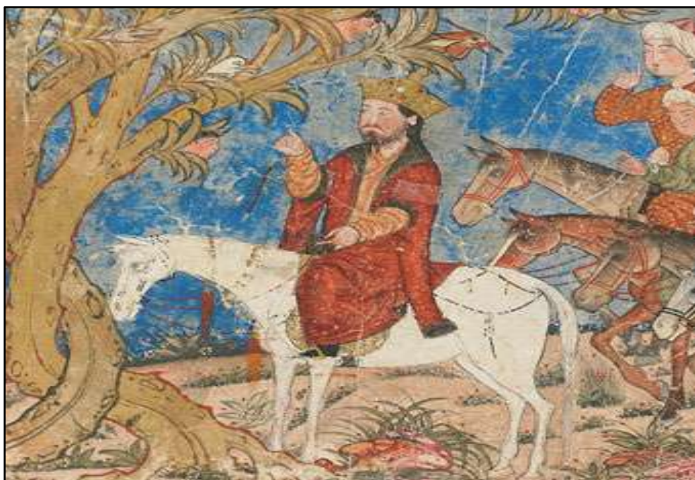
Fig.1 – An image of the Talking Tree from the Eskander nāma