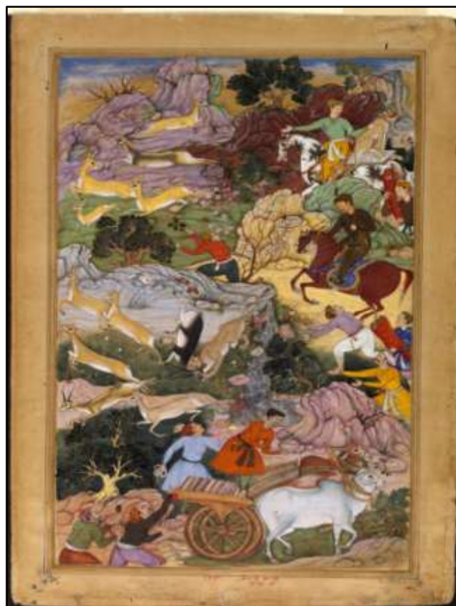
Fig. 3 – Akbar hunting Black buck: an illustration from the Akbar nāma