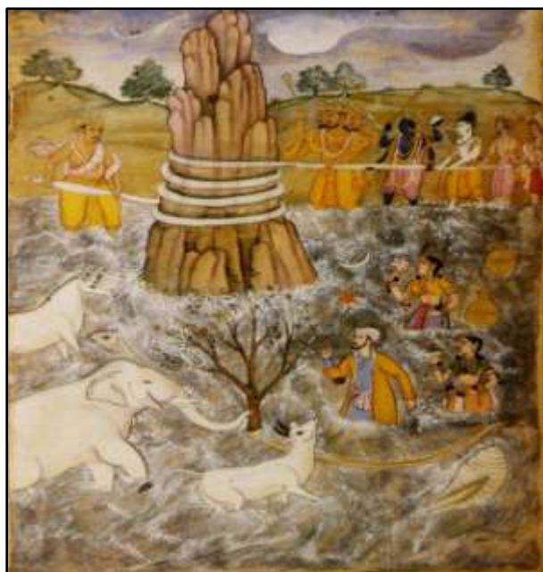
Fig. 5 – An illustration from the Razm nāma showing the churning of the ocean

translation workshop popularly known as the Maktab Khana at his capital city, Fatehpur Sikri where he commissioned the translation of many Sanskrit texts like the Rajatarangini , Valmiki's Ramayana and also the Babur nāma from Turkish to Persian since Persian was the court language of Akbar. The Razm nāma had two copies originally between which the second oldest copy is more accessible as some of its pages were exhibited at public and private collections in India, Europe and North America.