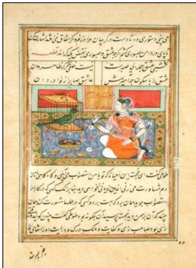
Fig. 6 – An illustration from the Tuti nāma , the merchant's wife talking to the parrot

two Iranian and Abdus Samamad created the illustrations embellished with stories within a span of five painters who were invited at the Mughal court by Akbar's father Humayun, Mir Saied Ali and Abdus Samamad created the illustrations embellished with stories within a span of five years.