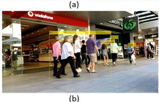
Fig. 1 (a) and (b) Two different shots of an unorganized scene for a crowded area