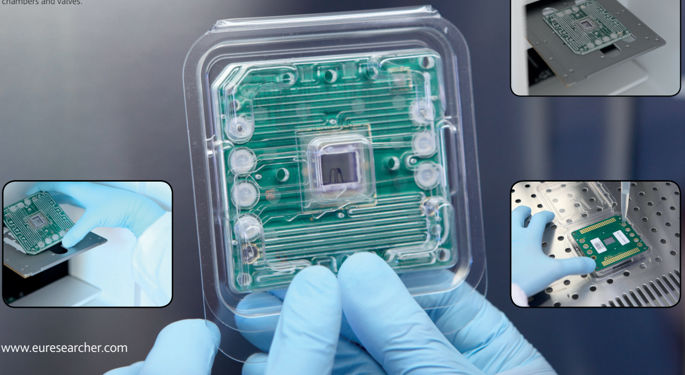
A selection of images of the core of the technology: the microsystem cartridge, which integrates a silicon chip, microfluidic chambers and valves.

The working principle of the DEPArray™ technology is based on the ability of a non-uniform electric field to exert forces on neutral, polarizable particles, such as cells, that are suspended in a liquid. This electrokinetic principle, called dielectrophoresis (DEP), is exploited to create - in the micro-chamber at the core of the cartridge - a patterned field force composed of tens of thousands of microscopic attraction regions (called DEP 'cages') capable of 'trapping' cells in stable levitation and controlled position.