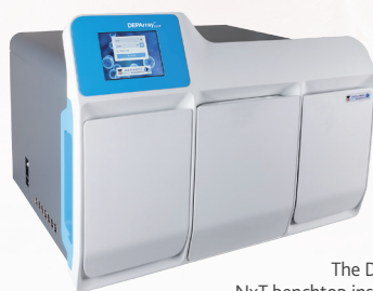
The DEPArray NxT benchtop instrument

The DEPArray™ technology is aimed at supporting precision medicine in oncology by enabling precise molecular characterization of a tumour. This will help clinicians to develop and implement protocols to match each patient with the correct combination of drugs, that will then work more effectively and improve patient outcomes