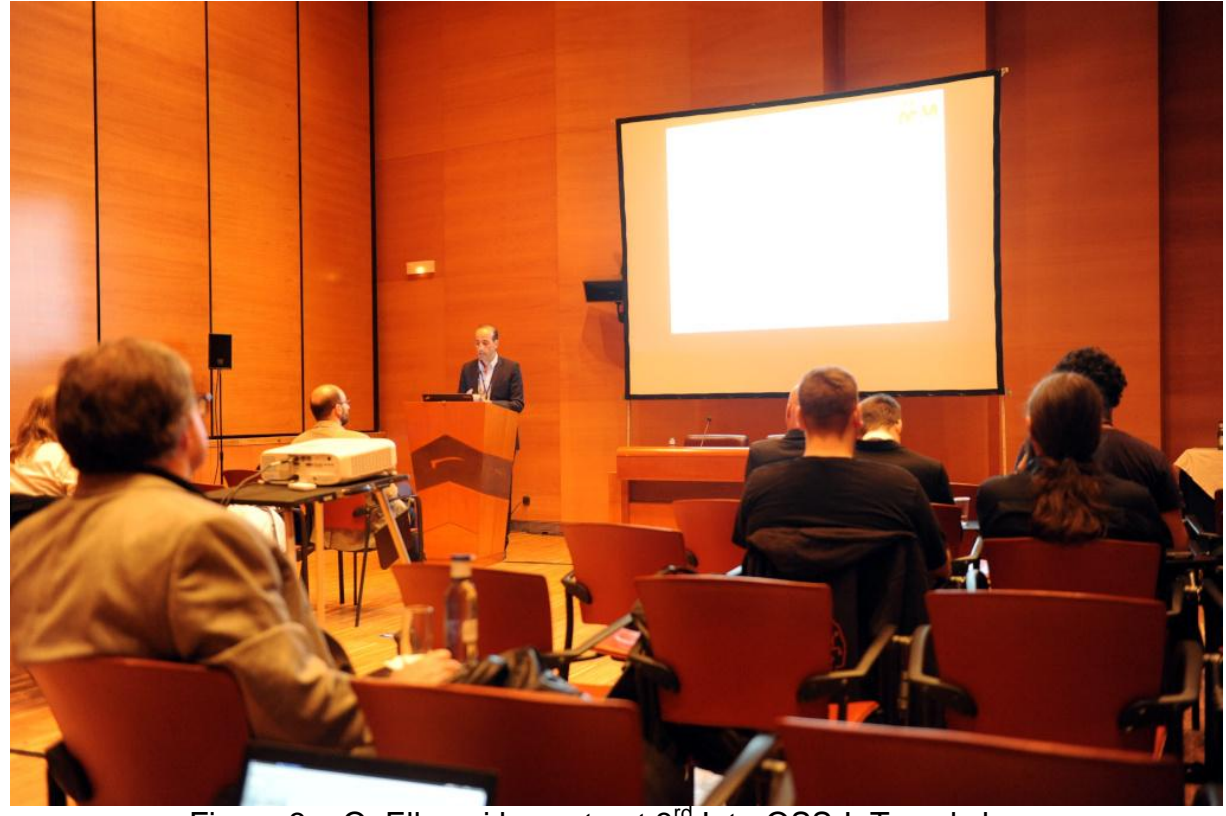
Figure 3 – O. Elloumi keynote at 3<sup>rd</sup> InterOSS-IoT workshop

Omar Elloumi from Nokia, OneM2M General Chair, who addressed the audience on Scaling the Internet of Things by providing an overview on the status of IoT industrial adoption and its scalability aspects, highlighting the interoperability remaining challenges and presenting a visionary perspective on how to address the coming scaling challenges.