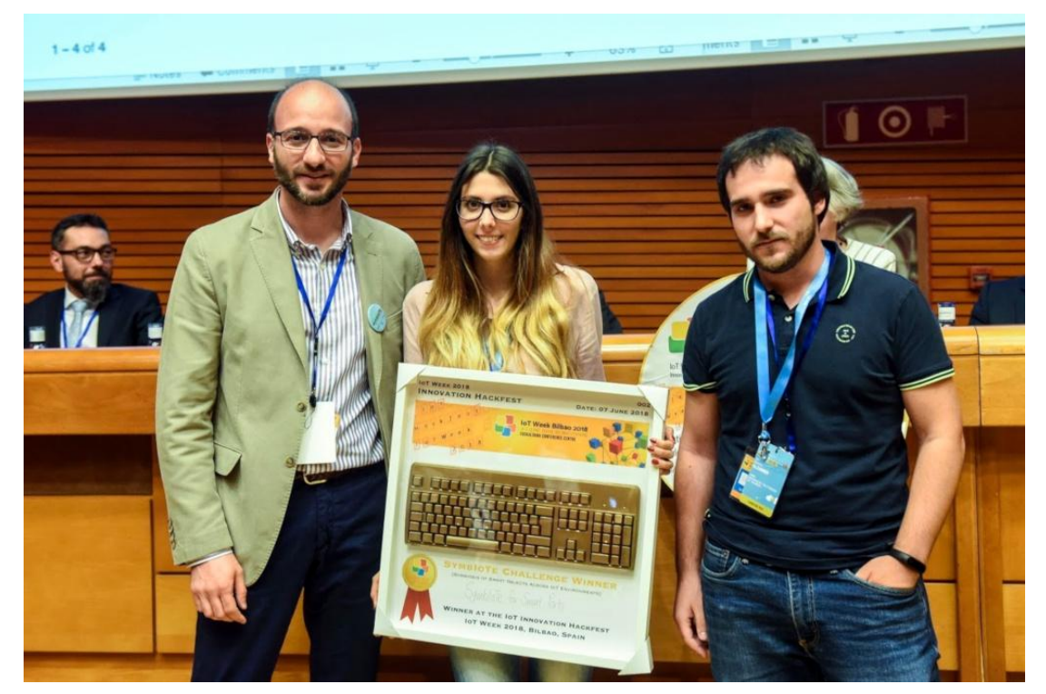
Figure 6 – The winning team of "SymbloTe for Smart Ports", together with the symbloTe coordinator, during the award ceremony of IoT Week 2018.

The three winning teams were announced on the same day, during the awards session of the closing ceremony of the IoT Week event.