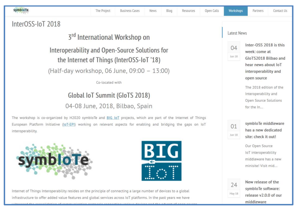
Figure 2 – The workshop summary page at symbloTe's web site