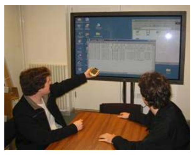
Figure 2. The plasma screen offers a social interaction space, headphones offer a private interaction space, while the PDA may offer either depending on its orientation with respect to the people.

refers to the conceptual area of public debate in which issues of general concern can be discussed and opinions formed. The private sphere, on the other hand, can be conceptualized as a virtual bubble around each of us. In this bubble we may keep information that is private to us – no one can access a private sphere besides its owner. Finally, social spheres are dynamically created and describe a semi-public state of information. Such information is not made completely public due to social rules and constraints. For instance, the movie being shown in a cinema does not belong to the public sphere because people do not have unconstrained access to it: they need to pay for a ticket.