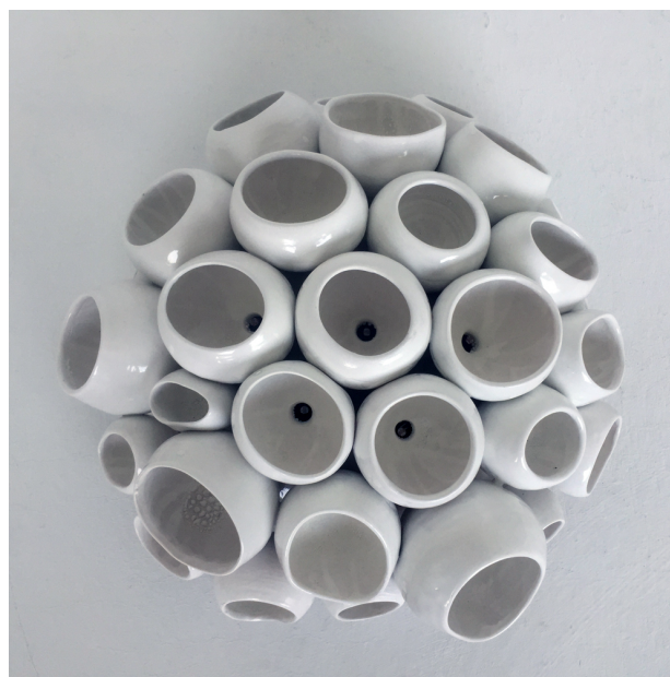
Figure 1. Top view of 14-inch diameter light sensitive ceramic sculpture

https://www.youtube.com/watch?v=PfqaFg_VNFw