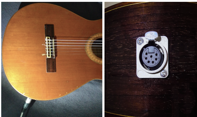
Figure 2: (a) Guitar and (b) 7-pin connector used in GuiaRT .

In 2014, the project acquired a new guitar—a Yamaha CG182—and RMC pickups for both instruments. At that time, the connectors on the lower side of the guitars were also replaced with more robust XLR 7-pin connectors (see Figure 2). Further efforts were dedicated to the extraction of additional descriptors, such as fundamental frequencies, spectral centroids, slurs, harmonics, pizzicatos and vibratos/bendings. A similar approach can be found in [24]. As each extraction procedure has a different latency (counting from the detected onset), the global list describing an event is generated at its offset. The definition of several midlevel descriptors—extracted in real-time from short excerpts selected by the performer—came next [25]. Visual and aural feedback is offered to the guitarist.