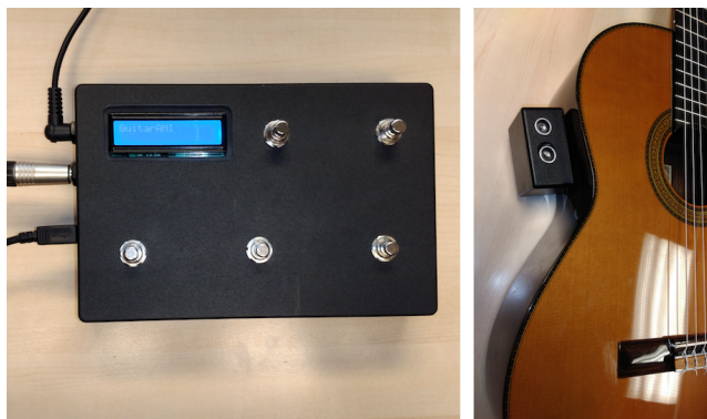
Figure 1: Current GuitarAMI Prototype. (a) Processing unit with embedded microprocessor and visual feedback; (b) GuitarAMI Wi-Fi sensor module and guitar body.

The current prototype (under construction—Figure 1) has embedded a new microprocessor into the GuitarAMI processing unit, using the Prynth 10 framework, while maintaining the footswitches and LCD. The sensor module communicates through Wi-Fi using OSC protocol, which allows GuitarAMI to interact with other devices and Digital Musical Instruments (DMIs) connected to the same network. We also replaced two sensors in the sensor module: the LSM9DS0 (Magnetic, Angular Rate and Gravity sensor—MARG) replaced the ADXL345 accelerometer, and the HC-SR04 ultrasonic sensor was replaced by the newer HC-SR04+, for better hardware compatibility.