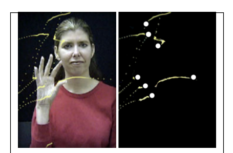
Figure 1. The 2 stimuli types. Left: phonetic-syllabic units. Right: point-light scenes. (yellow movement lines are for demonstration purposes).

Stimuli & Design. The stimulus consists of two types: (1) phonetic-syllabic units and (2) point-light stimuli ( Figure 1 ). The first type, short videos of signed phonetic-syllabic units produced by a native signer with neutral facial expression (previously piloted and published: Petitto et al., 2000) are homologous to the auditory presentation of short spoken consonant-vowel units (e.g., /ba/+/ka/, /ga/+/pa/) used in classic psycholinguistic studies (Kuhl, et al., 2006; Petitto et al., 2012). The phonetic-syllabic videos present language in the most ecologically authentic way possible, similar to how classic infant language acquisition studies