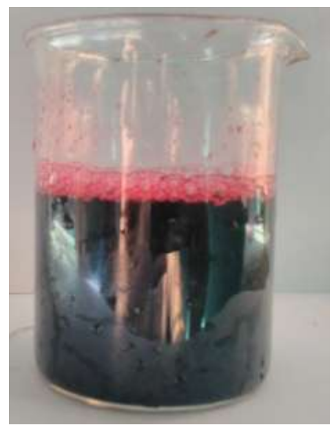
Figure 5:-Aqueous extract from the barks of Terminalia arjuna