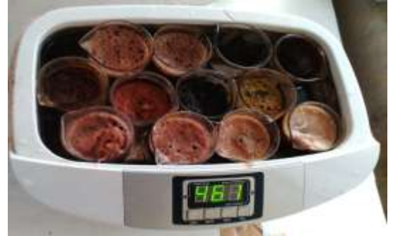
Figure 4:-Dyeing in Ultrasonicator

localized momentarily chemical reaction takes place between the fabric and the dye by this activated state as it results in forming shock waves and severe shear force which in capable of breaking chemical bonds.