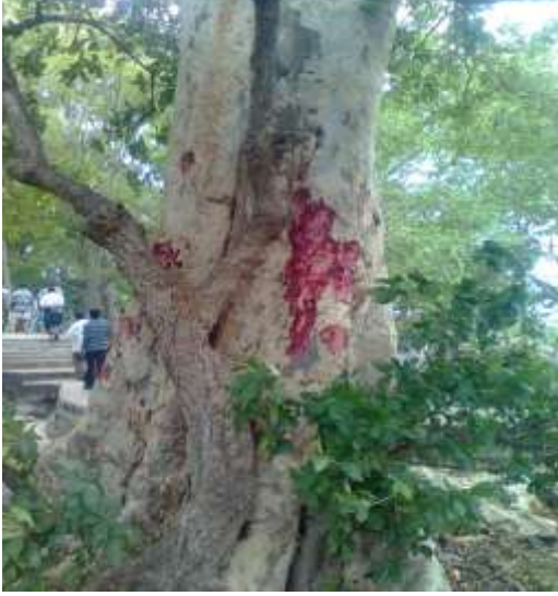
Figure 1:-Terminalia arjuna.L tree

Terminalia arjuna barks were collected from Hoganekkal, Dharmapuri district, Tamil Nadu, India.