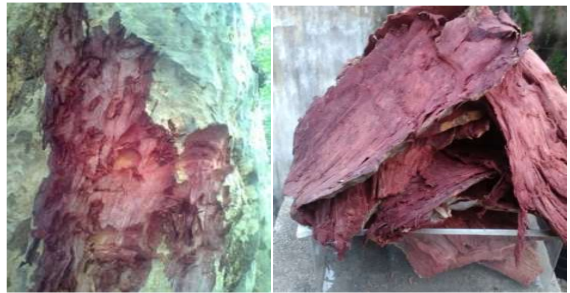
Figure 1:-Terminalia arjuna.L tree