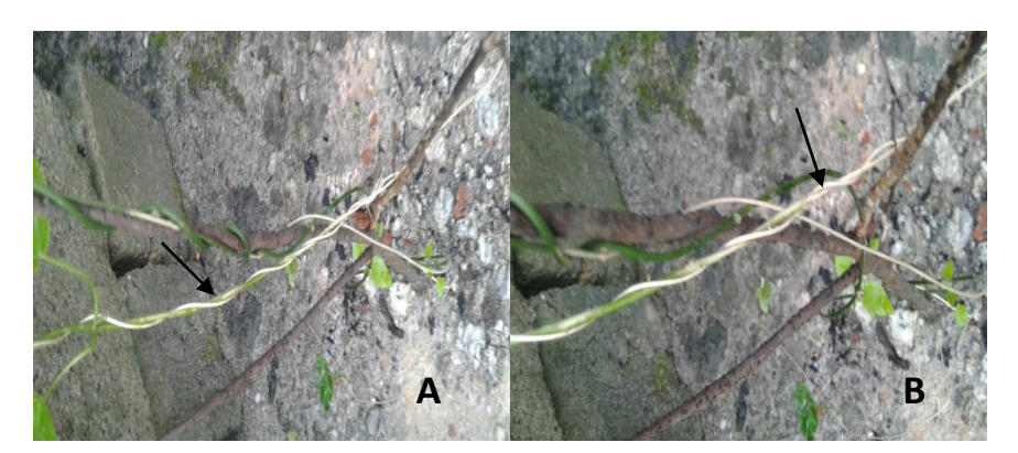
Figure 1. The growing plant stands of G. latifolium (A and B). Arrow pointing to the devastated and whitish stems of the plant

Four (4) stands of G. latifolium , growing wildly in the forest were obtained by cutting of mature stems with their regular nodes. They were cultivated in the area of study. They survived and flourished. At five (5) weeks of age, the garden snails invaded them, ate up the barks, leaving the stem whitish and exposed with distorted leaves. The plant stands became traumatized since photosynthetic tissues were affected by the attack, as shown in Figure 1 below: