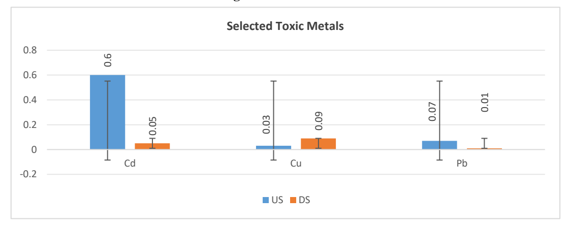
Figure 2: Comparative chart for Selected Toxic Metals Concentration Between Upstream and Downstream segments of Ava River