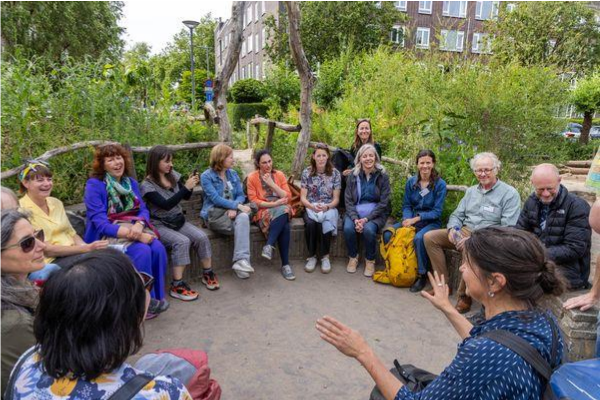
Thomas More University of Applied Sciences – train the teacher!