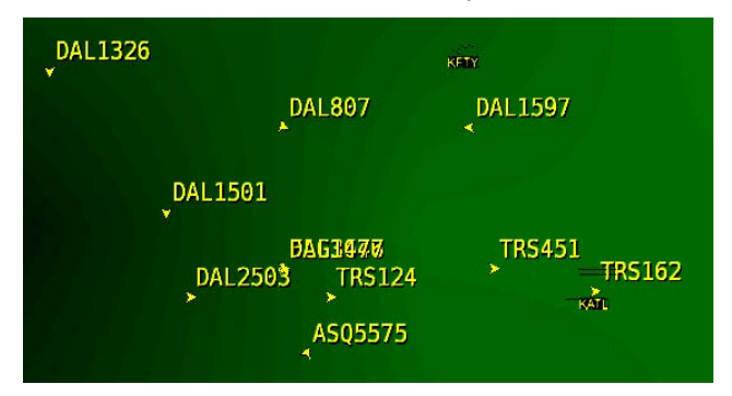
Figure 5. Live Traffic Portrayed in LaSRS++ NAS-Wide

wide simulation currently only takes advantage of aircraft state data, which is used to locate traffic for interactive modeling and for display on the Progress Monitor (Figure 5). However, the API already exists in the simulation to access weather data, flight plans, and all other information offered by the service.