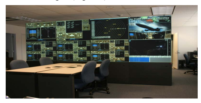
Figure 1. Langley ATOS Monitoring System [6]

The Langley Airspace and Traffic Operations (ATOS) and Air Traffic Operations Lab (ATOL) are development and test systems for new air traffic management concepts and airborne technologies [5]. This lab allows pilots and controllers to assess the usability, feasibility, and acceptability of new flight deck technologies (Figure 1).