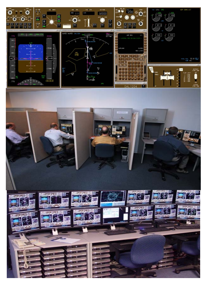
Figure 2. ATOL Displays and Controller Stations [6]

Within this lab are numerous "Aircraft for Traffic Operations Simulation Research" (ASTOR) stations, which can be configured to support single or dual crew operations (Figure 2). ATOL and ATOS are operated by the Crew Systems and Aviation Operations Branch (CSAOB) at LaRC. The lab can model hundreds of interactive background aircraft to create realistic scenarios as staging for the live pilot test subjects. Though the software is maintained independently by CSAOB, the systems have some commonality with the SDAB HITL simulator lab run using LaSRS++. The ATOL lab is also written in C++ and runs in either fast-time or real-time. The lab can run independently, or in joint simulations with the Cockpit Motion Facility (CMF) simulators linked to ATOL for expanded test missions. ATOL also has access to the LaSRS++ software repositories and configuration management system, and reuses some of the aircraft models from LaSRS++. Therefore, models that are developed under the LaSRS++ framework for the NAS-wide models will also be available to ATOL developers. This may be particularly useful for sharing the SMART NAS interfaces that will be created once that system is available.