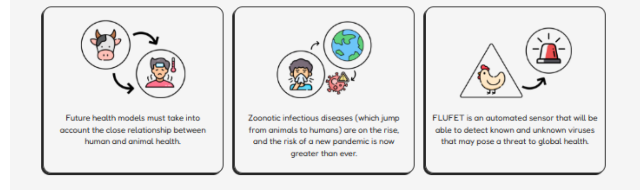
Figure 1. Front page of the FLUFET website, explaining the meaning of FLUFET acronym and mission of the project.

The European Parliament calls for continuous surveillance and harmonized data collection from animal farms. However, current methods are not suitable for continuous and automatic "in situ" detection, so only a limited number of specific and known pathogens are monitored today.