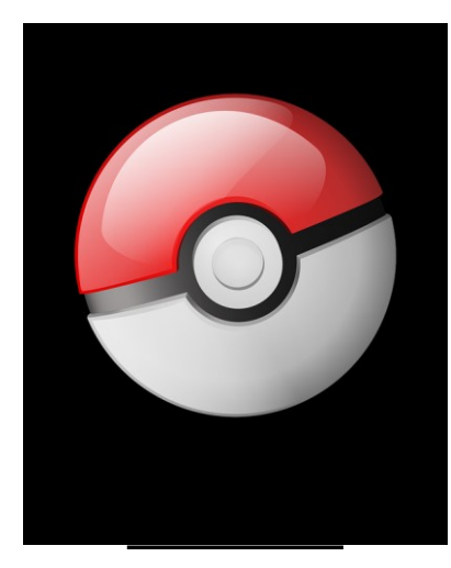
capture your KO's!