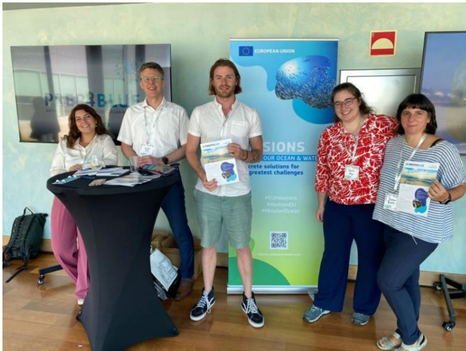
Figure 12. Prep4Blue representatives at the EurOcean Conference 2023 on the 10th and 11th of October in Vigo (Spain).