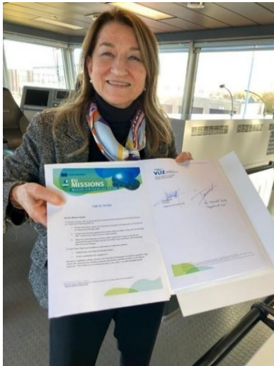
Figure 9. Delilah Al Khudairy (DG MARE) with the Charter signed by the governor of West-Flanders and the SG of Science Economy and Innovation of Flanders