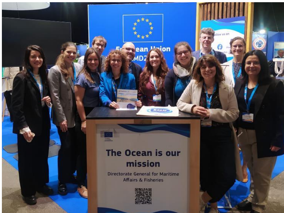
Figure 11. Prep4Blue partners present at the European Maritime Days on the 24 th and 25 th of May in Brest (France) : CRPM/CPMR, JPI Ocean, S. Pro, Ifremer, KDM, EuroMarine and ERINN Innovation.