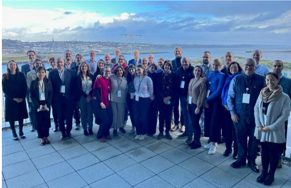
Figure 4. BlueMissionAA kick-off meeting, side event of the launch of the Atlantic-Artic LH launch. Prep4Blue partners attending the Atlantic-Artic LH launch: Ifremer, KDM, JPI Ocean, CRPM, MaREI-UCC, SDU, CRPM.