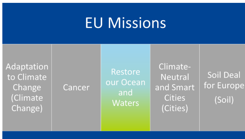
Figure 1. The five EU Missions of Horizon Europe

Through new forms of collaboration and governance, stakeholder and citizen engagement, the five EU Missions (Ocean and Waters; Climate Change; Cancer; Cities; Soil) will deliver concrete solutions to some of our greatest challenges (Figure 1).