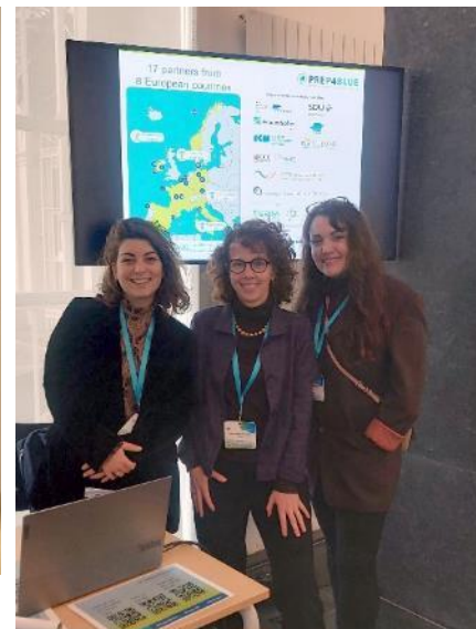
Figure 6. Prep4Blue partners at Prep4Blue's booth at the Mission Annual Forum (17 th February 2023 – Brussels, Belgium).