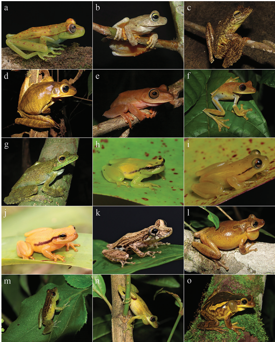
Figure 4. Amphibians from Reserva Ecológica Michelin, Bahia State, Northeastern Brazil. a Boana atlantica b Boana crepitans c Boana exastis d Boana faber e Boana pombali f Boana semilineata g Itapotihyla langsdorffii h Phyllodytes melanomystax i Phyllodytes praeceptor j Phyllodytes sp. k Olohygon strigilata l Scinax eurydice m Scinax juncae n Scinax x-signatus o Trachycephalus mesophaeus .