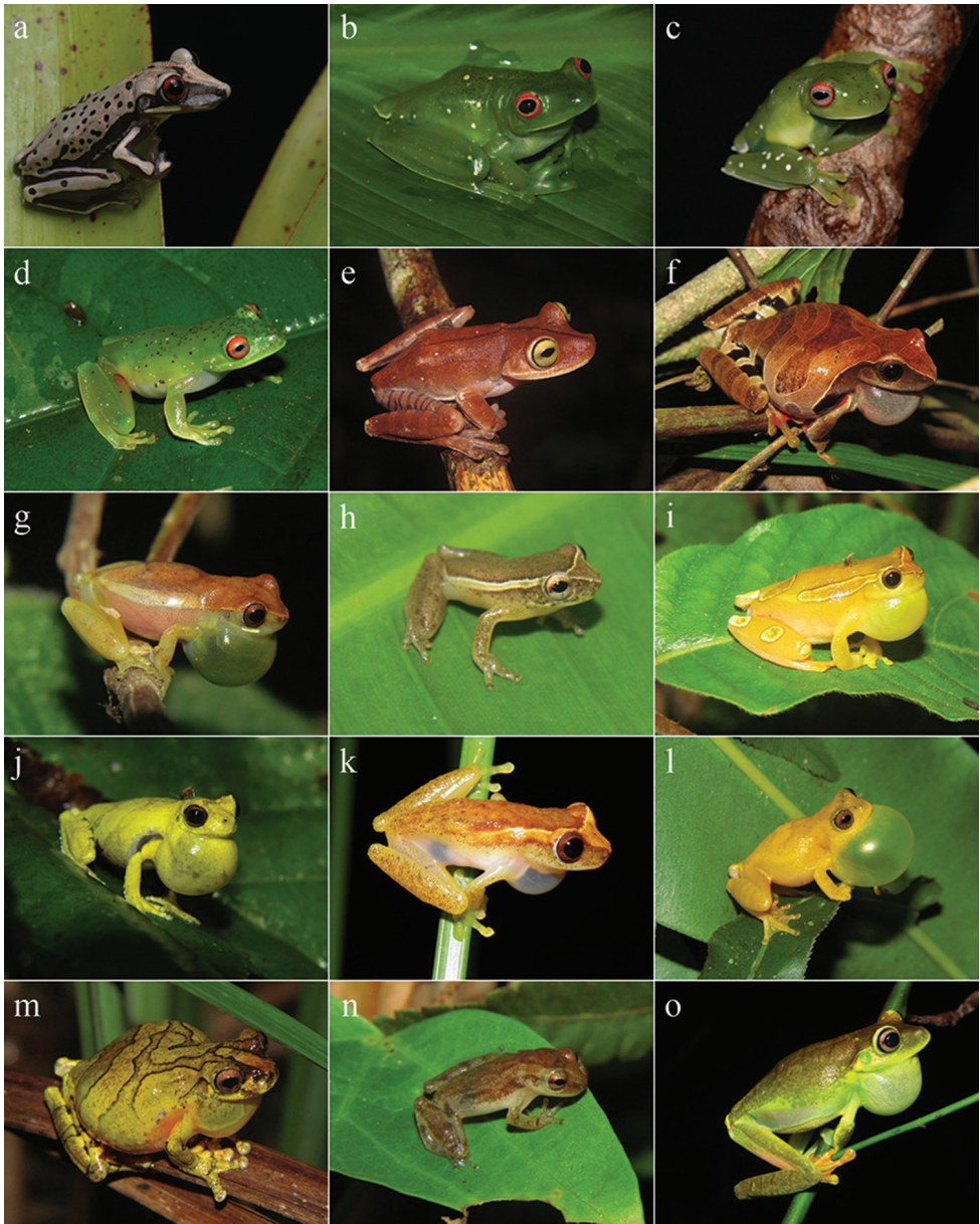
Figure 3. Amphibians from Reserva Ecológica Michelin, Bahia State, Northeastern Brazil. a Aparasphenodon brunoi b Aplastodiscus cavicola c Aplastodiscus ibirapitanga d Aplastodiscus sibilatus e Bokermannohyla capra f Dendropsophus anceps g Dendropsophus branneri h Dendropsophus decipiens i Dendropsophus elegans j Dendropsophus giesleri k Dendropsophus haddadi l Dendropsophus minutus m Dendropsophus novaisi n Dendropsophus aff. oliveirai o Boana albomarginata .