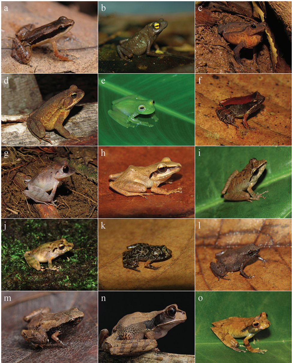
Figure 2. Amphibians from Reserva Ecológica Michelin, Bahia State, Northeastern Brazil. a Allobates olfersioides b Frostius erythrophthalmus c Rhinella boogmoedi d Rhinella crucifer e Vitreorana eurygnatha f “ Eleutherodactylus ” bilineatus g Haddadus binotatus h Pristimantis paulodutra i Pristimantis sp. j Pristimantis vinhai k Adelophryne cf. pachydactyla l Adelophryne mucronatus m Adelophryne sp. n Gastrotheca recava o Gastrotheca sp.