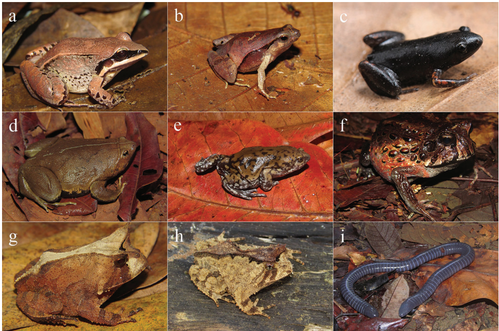
Figure 6. Amphibians from Reserva Ecológica Michelin, Bahia State, Northeastern Brazil. a Leptodactylus mystaceus b Physalaemus camacan c Chiasmocleis cordeiroi d Stereocyclops incrassatus e Dermatonotus muelleri f Macrogenioglottus alipioi g Proceratophrys renalis h Proceratophrys schirchi i Siphonops annulatus .

et al. in prep ). Vitreorana sp. was recorded by Camurugi et al. (2010) only in larval form, but adult males were collected and, using morphological and bio-acoustic traits, are identified as Vitreorana eurygnatha . Scinax aff. alter and Chiasmocleis sp. are re-classified as Scinax juncae and Chiasmocleis crucis , respectively. Phyllodytes luteolus as Phyllodytes praeceptor (Orrico et al. 2018). The species formerly classified as Dendropsophus seniculus , Physalaemus signifer and Leptodactylus marmoratus , are now classified as Dendropsophus novaisi , Physalaemus camacan and Adenomera thomei , respectively.