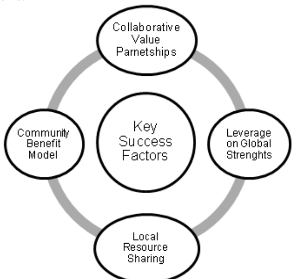
Figure 2: Key Success Factors for sustainable and scalable growth in BOP Markets

Most of the thinkers on sustainable businesses or on base of the pyramid markets theorists also have propounded scalability and building sustainable businesses in base of the pyramid requires innovative strategies that focus on sustainable environmentally and community friendly value chain creations that elucidate capability generation over time and in a sustained manner. Socially embeddedness is what will drive deep rooted business growth and sustenance.