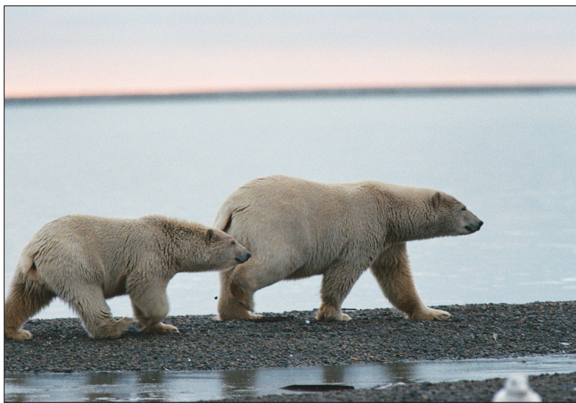
Figure 2. An adult female polar bear and her yearling onshore in the southern Beaufort Sea during the annual sea-ice minimum. An increasing proportion of the southern Beaufort Sea population has come onshore in recent years (Schliebe et al. 2008; USGS unpublished data).

Because global warming has reduced the spatiotemporal availability of sea ice, polar bears are spending more time on land – in both seasonal (Stirling et al. 1999) and historically perennial sea-ice habitats (Figure 2; Schliebe et al. 2008). In seasonal ice habitats, such as western Hudson Bay, increased duration of the ice-free period has coincided with declines in polar bear body mass, condition, cub survival (Stirling et al. 1999; Rode et al. 2010), and population