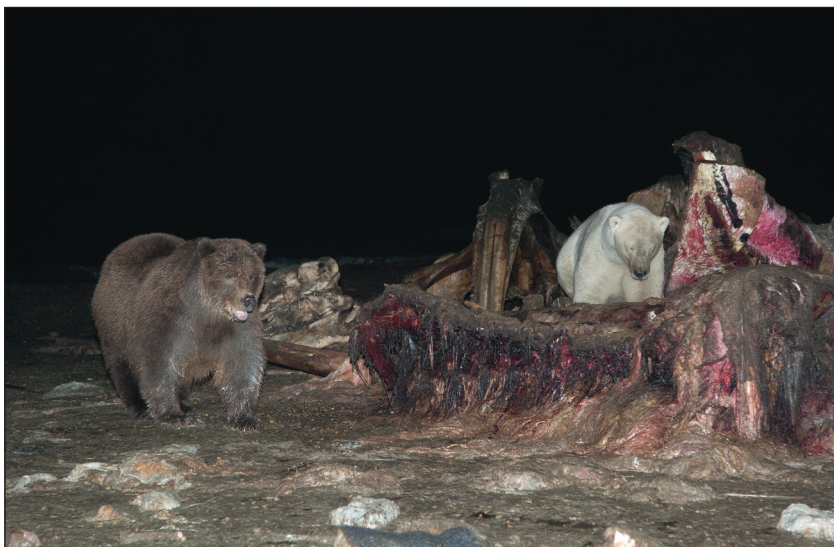
Figure 4. A polar bear and a brown bear feeding at the remains of a bowhead whale ( Balaena mysticetus ) carcass harvested by human subsistence hunters in the southern Beaufort Sea. Over much of the polar bear's range, terrestrial habitats are occupied by brown bears, which consume many of the available terrestrial food resources and, as in this case, compete for marine-mammal carcasses.

The population ecology of brown bears in terrestrial Arctic landscapes offers some of the best evidence that these habitats are unlikely to provide substantial food resources for polar bears, even over short time periods. In Arctic landscapes, brown bears occur at very low densities (Miller et al. 1997) and are among the smallest of their species (Hilderbrand et al. 1999). Food availability was determined to be the most important factor limiting a brown bear population in the Canadian Arctic (McLoughlin et al. 2002). Food limitations would be particularly problematic for the much larger polar bears, which often have a body mass double that of Arctic brown bears. Observations suggest that brown bears, which occur on land adjacent to much of the polar bear's circumpolar sea-ice habitat, can displace polar bears from feeding sites (Figure 4; S Miller pers comm). Furthermore, brown bears already occupy Arctic coastal terrestrial habitats throughout much of the polar bears' range and consume terrestrial food resources. For example, in 2013, two to three brown bears and associated avian predators consumed eggs from >90% of about 2000 black brant ( Branta bernicla nigricans ) and lesser snow goose nests on the southern Beaufort Sea coast (J Hupp and D Ward pers comm). Polar bears forced onto land due to sea-ice loss will have to compete with brown bears