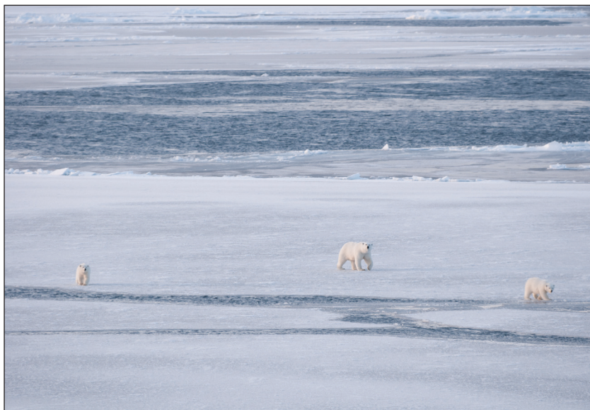
Figure 1. A polar bear family on the sea ice in the Chukchi Sea. Often remaining on sea ice year-round, polar bears hunt for ringed seals and bearded seals ( Erignathus barbatus ), which require sea ice for hauling out, molting, and pupping.

Polar bears currently only inhabit areas covered by Arctic sea ice for much of the year. They are divided into 19 recognized subpopulations within four identified ecoregions (based on annual sea-ice dynamics; Amstrup et al. 2008). Over most of their range (ie in three of the four ecoregions), entire populations have historically remained on sea ice year-round, where they hunt marine mammals (Figure 1), with only pregnant females regularly venturing onto land to occupy maternal dens. In the fourth, seasonal ice ecoregion, there has been no multi-year or perennial ice throughout the human historical record. Here, polar bears actively prey on marine mammals from seasonally available sea ice. After forag-