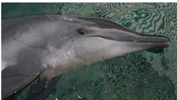
Figure 5 Rough-toothed dolphin in a rehabilitation pool at Ocean Park; the dolphin was live-stranded on 14 May 2004.

Although Parsons et al. (1995) reported this species in Hong Kong based on a stranding record that occurred on 7 March 1982, re-examination of the files for this event provided no justification for the identification. However, there have been two strandings of this species in recent years. The first occurred on 8 May 2003, with a carcass found floating near Green Island. The second was a live stranding of a 214-cm male that occurred on Lamma Island on 14 May 2004 (Hung 2005a,b; Figure 5). The latter specimen was taken to Ocean Park for rehabilitation, where it survived for 10 months. It finally died on 6 March 2005. Necropsy revealed several health problems, including evidence of brain and heart pathology, and possible gastric problems resulting from tube feeding.