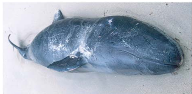
Figure 4 False killer whale live-stranding that occurred on 19 August 2002.

Several species of the family Delphinidae occur in the South China Sea. Four strandings of the false killer whale have occurred in Hong Kong, one in 1983 (Parsons et al. 1995), one in 2000, one live-stranded on 19 August 2002 (Figure 4), and one in 2005 (Hung 2003, 2006). In addition, a sighting of "at least eight" false killer whales, supported by photos, was recorded on 10 March 1996 off Tsing Yi by a group of dolphin-watching tourists