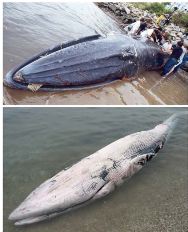
Figure 2 Bryde's whale stranded in Macau on 30 August 2000 (top) and Bryde's whale stranded in Hong Kong on 6 February 2005 (bottom).

There are a number of confirmed stranding records of Bryde's whales from Hong Kong (Parsons et al. 1995, 1999, Hung and Jefferson 2001), along with several well-described second-hand sightings of what would appear to be this species in eastern waters (Jefferson, unpublished data). Although not actually within Hong Kong, an 11.9-m male Bryde's whale was live-stranded in Macau (approx. 25 km across the Pearl River Estuary, to the west of Hong Kong) on 30 August 2000 (Figure 2; Hung 2001). Two strandings of this species occurred in Hong Kong in the 1990s, the first at Cheung Chau in 1992 and the second at Tolo Harbor Channel in 1994 (Parsons et al. 1995). There have been five additional confirmed or probable strandings of this species in Hong Kong over the past several years (one in 2003, two in 2004 and three in 2005; Hung 2004, 2005a, 2006; see also Figure 2). In addition, a sighting of a specimen thought to be