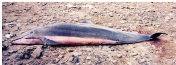
Figure 8 Fraser's dolphin stranding that occurred 31 May 1995.

male at Plover Cove in Tolo Channel on 31 May 1995 (Figure 8; Parsons et al. 1995). The species has not been sighted in waters in or immediately adjacent to Hong Kong, and probably occurs far offshore in this area.