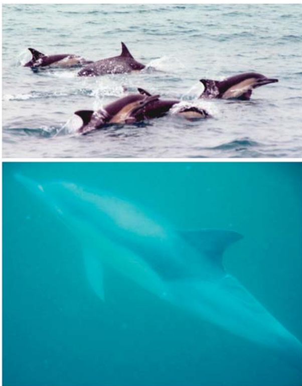
Figure 7 Group of long-beaked common dolphins that swam into Victoria Harbor in February 1978 (top) and a common dolphin sighted on 26 February 2006 in Sai Wan Ho (bottom).

Only a single Fraser's dolphin record exists for Hong Kong. This was a stranding of a freshly dead 220-cm