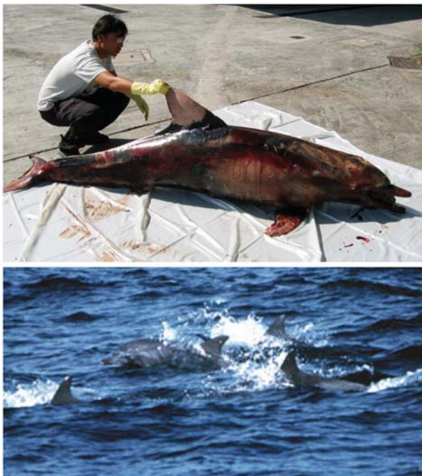
Figure 6 Indo-Pacific bottlenose dolphin stranding that occurred on 16 August 2004, the first confirmed record for this species in Hong Kong (top) and sighting of a group of probable Indo-Pacific bottlenose dolphins on 5 November 1998 near Po Toi Island (bottom).

addition, a sighting of a single young animal in the eastern waters of Sai Kung was recorded in 1995 (Jefferson, unpublished data, also mentioned in Parsons et al. 1995). The latter animal was clearly lost or sick/injured, but no subsequent stranding was reported from this very sparsely populated part of Hong Kong.