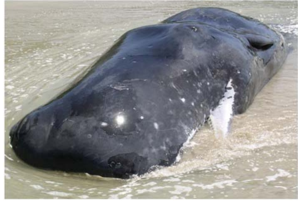
Figure 3 Sperm whale live-stranding that occurred on 21 July 2003.

Both species of the family Kogiidae occur in the area. Four records of strandings of whales of the genus Kogia