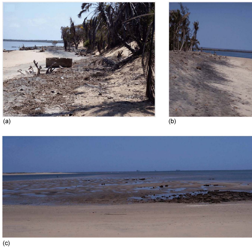
Figure 4. (a) Tsunami impact evidence at the Ngomeni Peninsula marked by debris. (b) Black sand, rich in heavy minerals, deposited by the tsunami. (c) Tidal situation at about the time of the tsunami inundation. In the area of the Galana River mouth, there is no reef. Oil rigs are visible in the distance.

nami inundation could be observed; eyewitness accounts were difficult to find, since this area is sparsely populated. Even in Malindi, no evidence of tsunami impact could be found at the time of this survey.