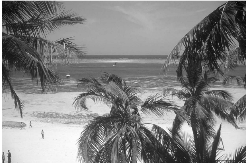
Figure 2. Reef top exposed at low tide approximately 10 km north of Mombasa.