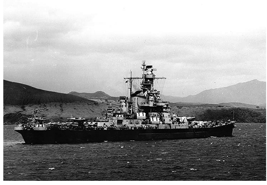
Figure 3. The U.S.S. Indiana.

Following shakedown cruises in Casco Bay, Maine, the new battleship steamed through the Panama Canal to bolster the U.S. fleet in the Pacific during the critical early months of World War II. She joined Rear Admiral Lee's carrier screening force on 28 No-