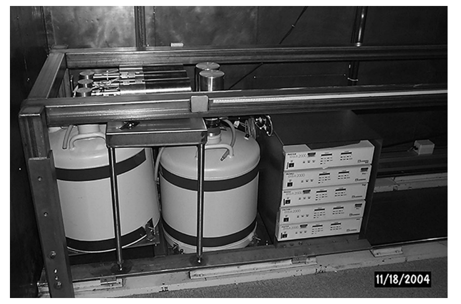
Figure 1. Coaxial germanium measurement system.