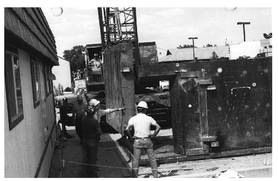
Figure 4. Shielded room construction at the IVRRF.

In addition to the VA hospital facility, several large sections of the hull weighing a total of 210 tons were also fabricated into a room. These applications were probably never imagined by the original designers of the Indiana . These sections of the hull are still being used for the original purpose as a shield; but instead of protecting against artillery shells and torpedoes the new purpose is to shield radiation detectors from the background radiations originating from cosmic, atmospheric, man-made, and terrestrial sources. The larger room was initially constructed at the University of Utah Medical Center in Salt Lake City, Utah. The counting facility was located below grade to take advantage of the