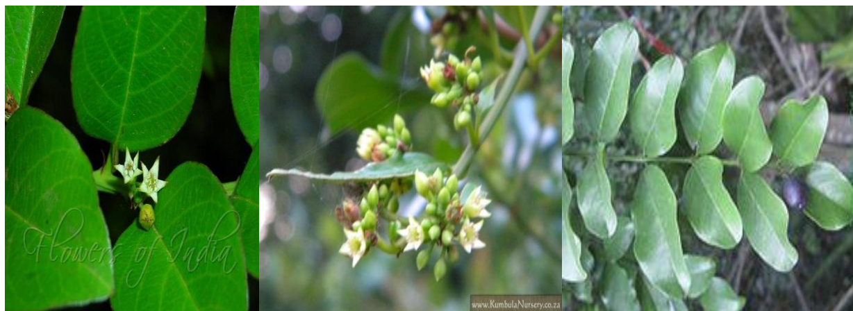
Fig: 1.Plants of scutia myrtina

A edible fruit is subglobose-obovoid drupe is 4-5mm in diameter with a thin, fleshy pulp that contains two-seeded stones, apiculate, dark blue when ripe, seeds 2-4, subglobose, compressed, fruiting pedicel 3-4mm, glabrous, seeds brown, flat, obcordate.